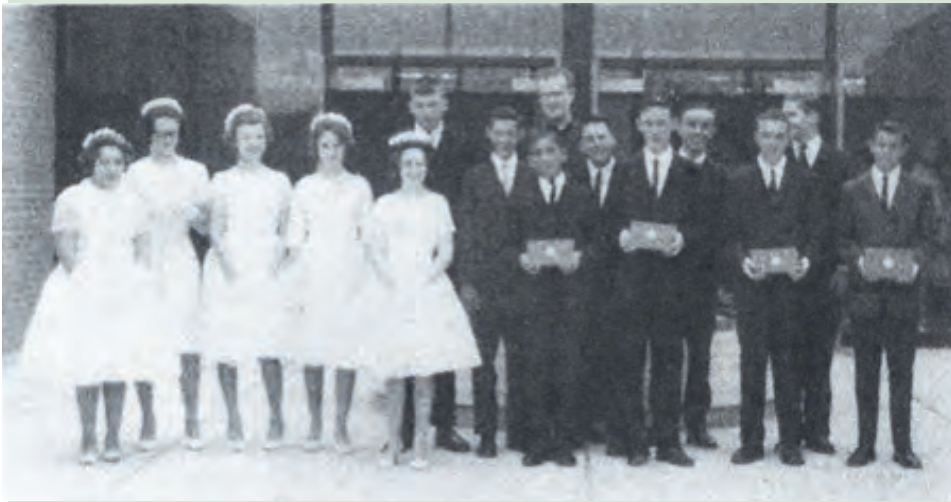
First Graduation Class 1963