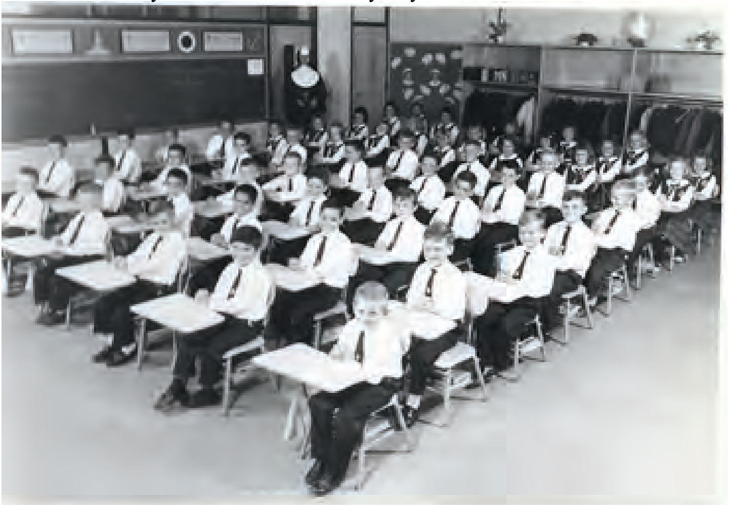
St. Raymond School - The Early Days - First Grade 1963-64