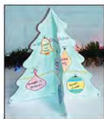
Weeks 1 & 2 together.