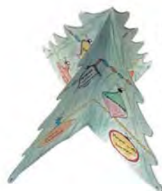
Different angles of completed tree.